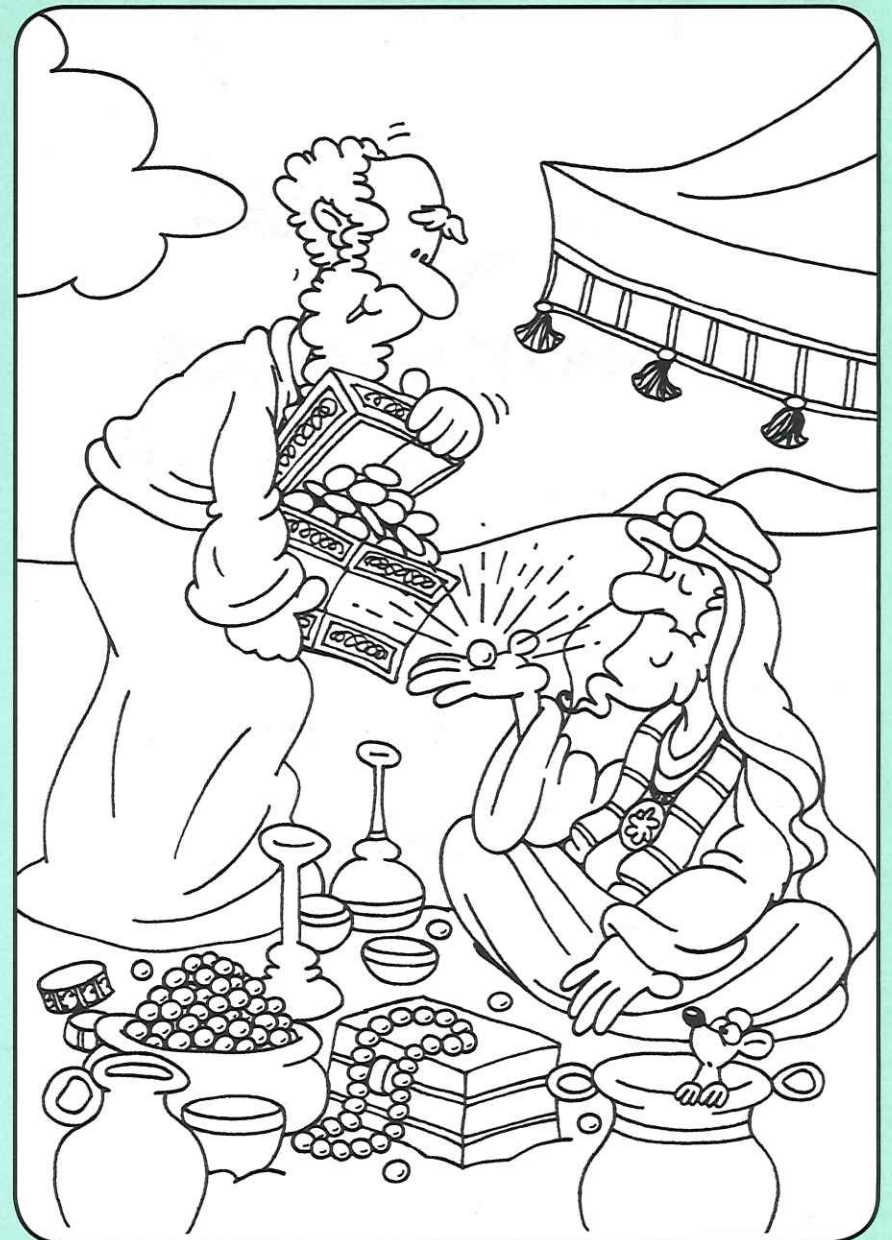
The kingdom of heaven is like treasure.