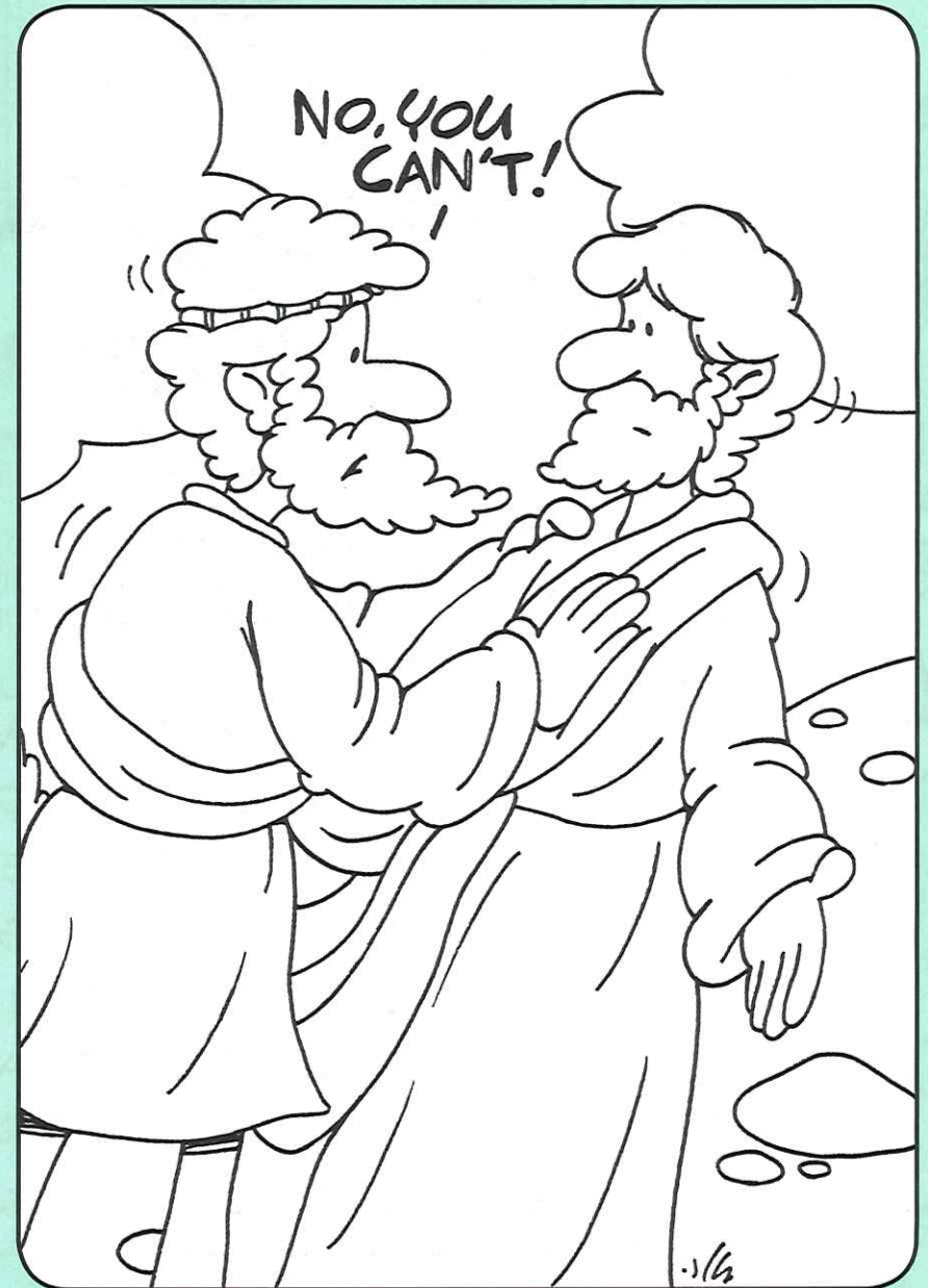
Peter took Him aside and began to rebuke Him. Matthew 16:22