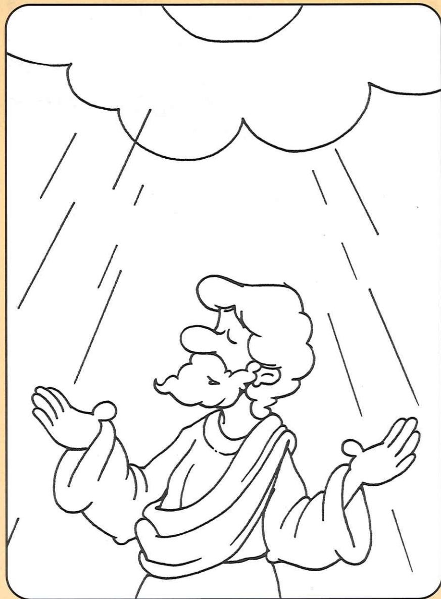
Grace and truth came through Jesus Christ.