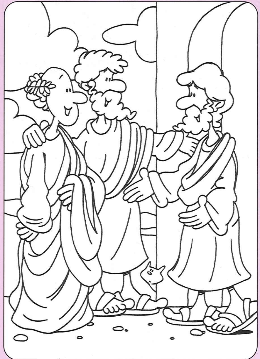
We wish to see Jesus.