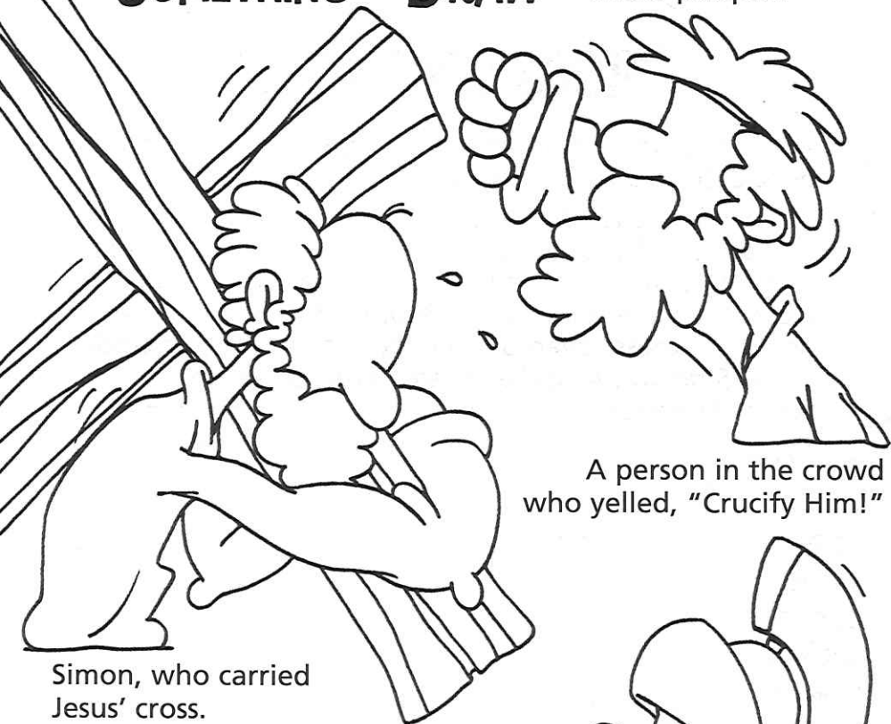
A person in the crowd who yelled, "Crucify Him!"