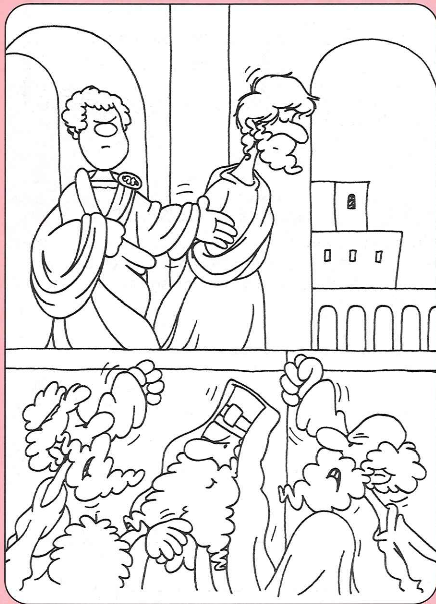
They bound Jesus and led Him away and delivered Him over to Pilate. Mark 15:1